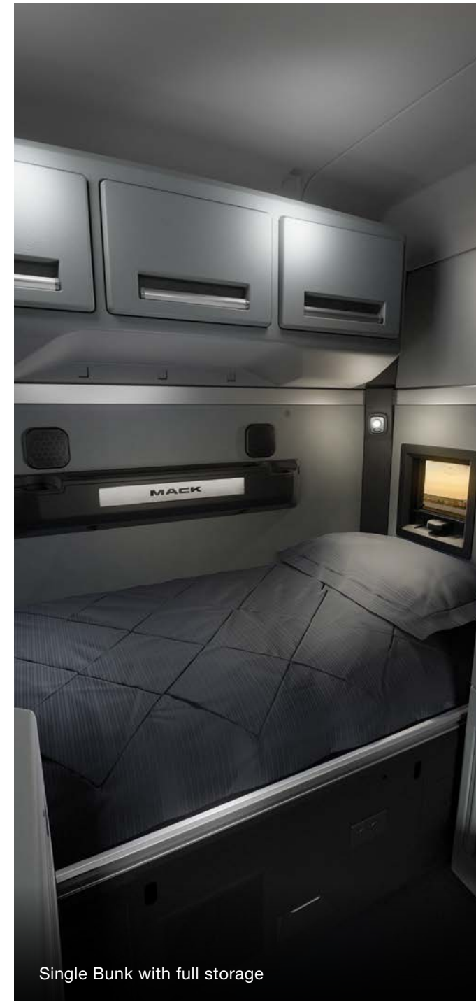
Single Bunk with full storage