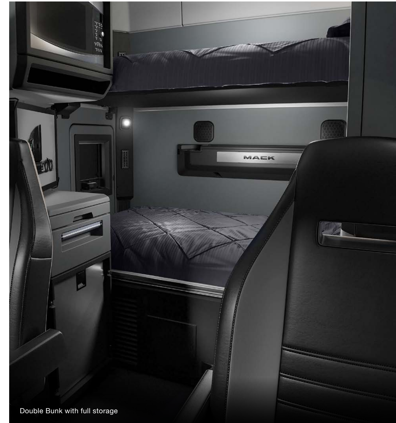
Double Bunk with full storage