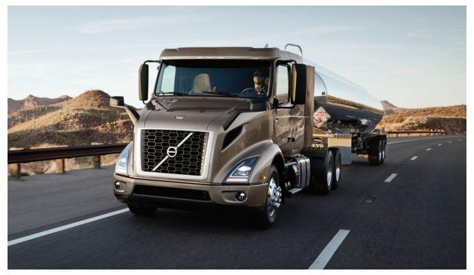
Volvo Connect gives you instant access to information that improves productivity and profitability.